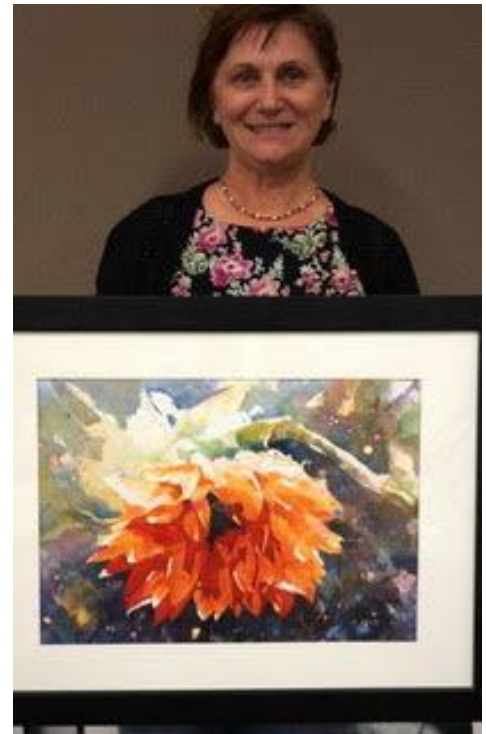
Second Place – Sunflower by Crystyna Dale