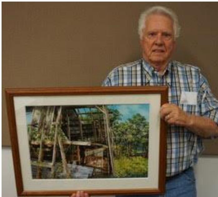
First Place – Ozark Barn by Bob Wood