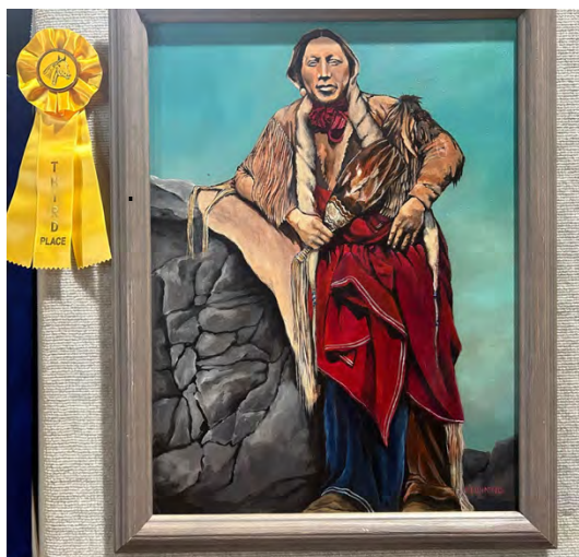
Old Quannah Parker