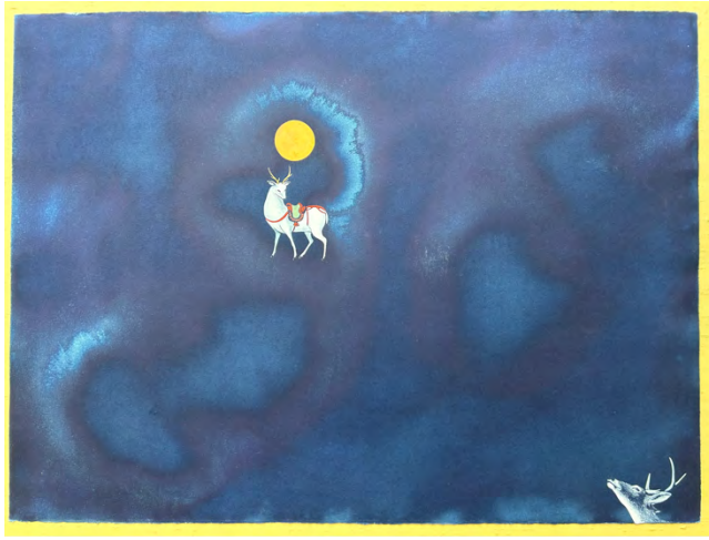
Divine Messenger of the Gods, Kasuga Deer