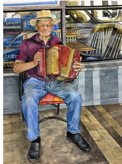
Kiwi Music Man