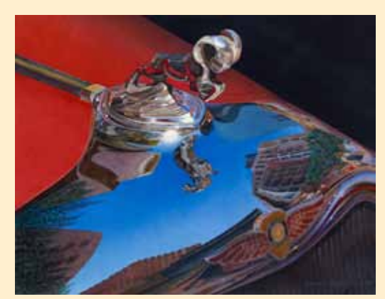
DAVE MAXWELL "KING OF THE HILL" FIRST PLACE