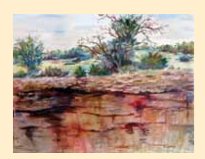
NORMA LIVELY "POSSUM KINGDOM"