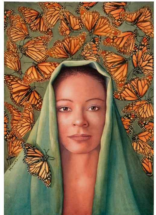
2016 Best of Show: Alma with Monarchs by Muriel Mimura